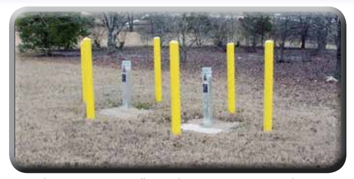
Groundwater monitoring wells at Duke Energy's Oconee Nuclear Station

Duke Energy recently tapped EPRI's expertise and technical support for assistance in performing groundwater self-assessments at its nuclear plants in the southeastern United States. EPRI identified a number of strengths in Duke Energy's ground-