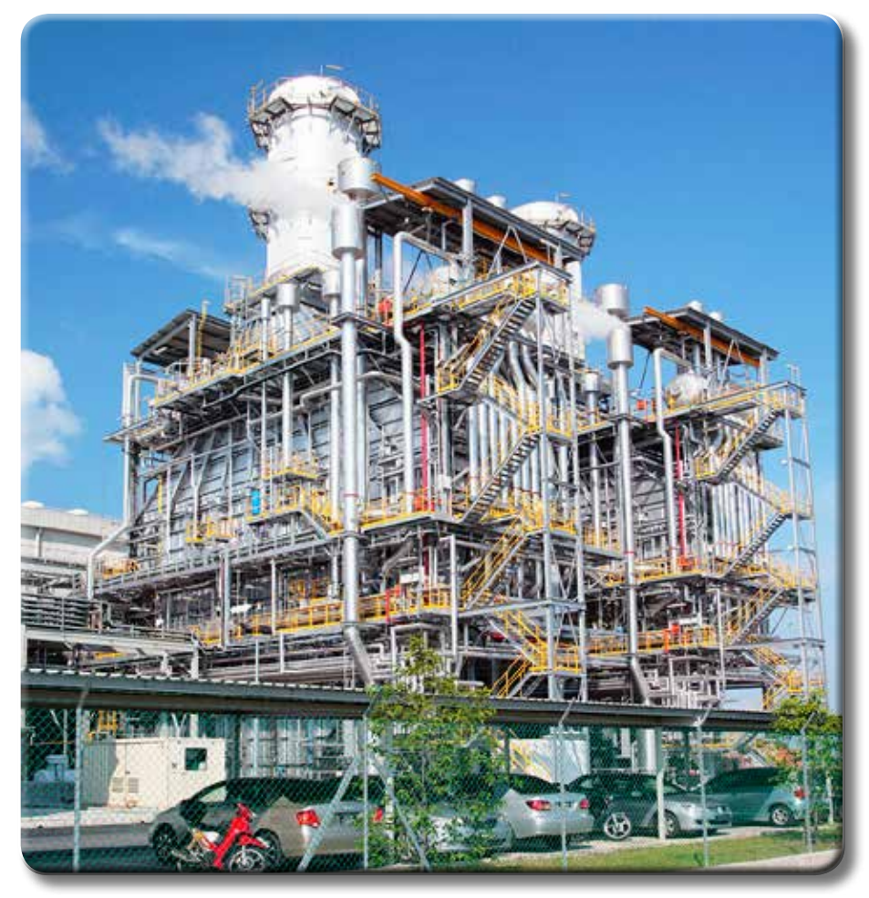
HRSG at the Keppel Cogen Power Plant, Singapore

Schroeder has been pushing EPRI members to clarify what they need to define in a consensus specification for the product