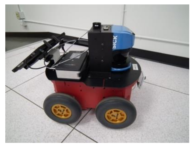
EPRI's AMMP robot evaluates lighting and other factors in indoor and outdoor spaces.

The pace of innovation has ended a long era of product dominance, exemplified by the 100-year run of incandescent bulbs. Predictions of LED dominance by 2025 may or may not pan out. "What's to say that the next product in the pipeline won't beat out LED," said Sharp. "Lighting will continue to offer large energy savings, and by 2035 these savings will be much larger than today." Indeed, EPRI research has shown that commercial indoor lighting can yield 180 terawatt-hours of savings through 2035. 180 terawatt-hours is about 5% of U.S. end-use electricity consumption in 2013 (based on data from the U.S. Energy Information Administration's Annual Energy Outlook 2015 ).