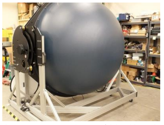
This two-meter integrating sphere in EPRI's lighting lab is used to evaluate illuminance and other lighting characteristics.