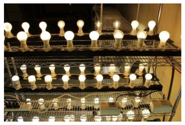
Evaluation of power cycling and lifespan of various screw-in lamps in EPRI's lighting lab.

EPRI's lighting team is charged with understanding the spectrum of lighting technologies—halogen, compact fluorescent (CFL), HID, LED products, light-emitting plasma, and induction, to name a few. Utilities manage an array of lighting programs, ranging from rebates and customized incentives to accelerated replacement, consultation, design, and specialized rates. With so many new commercial products, it is inevitable that some will fail or fall short of manufacturers' claims. Utilities must be progressive and cautious, and EPRI helps them navigate the opportunities and pitfalls.