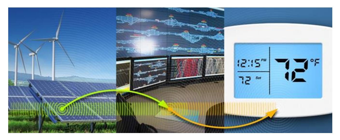
Field Demonstrations Show Effectiveness of Communications Language, Reveal New Applications