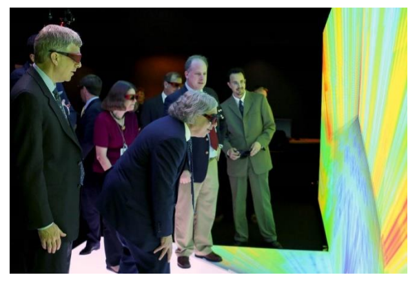
U.S. Energy Secretary Ernest Moniz views a 3-D simulation of a nuclear reactor core enabled by VERA.

The VERA software is made up of many interacting computer codes that will enable researchers to simulate the atomic-level physics of any reactor core element at any time, with unprecedented clarity.