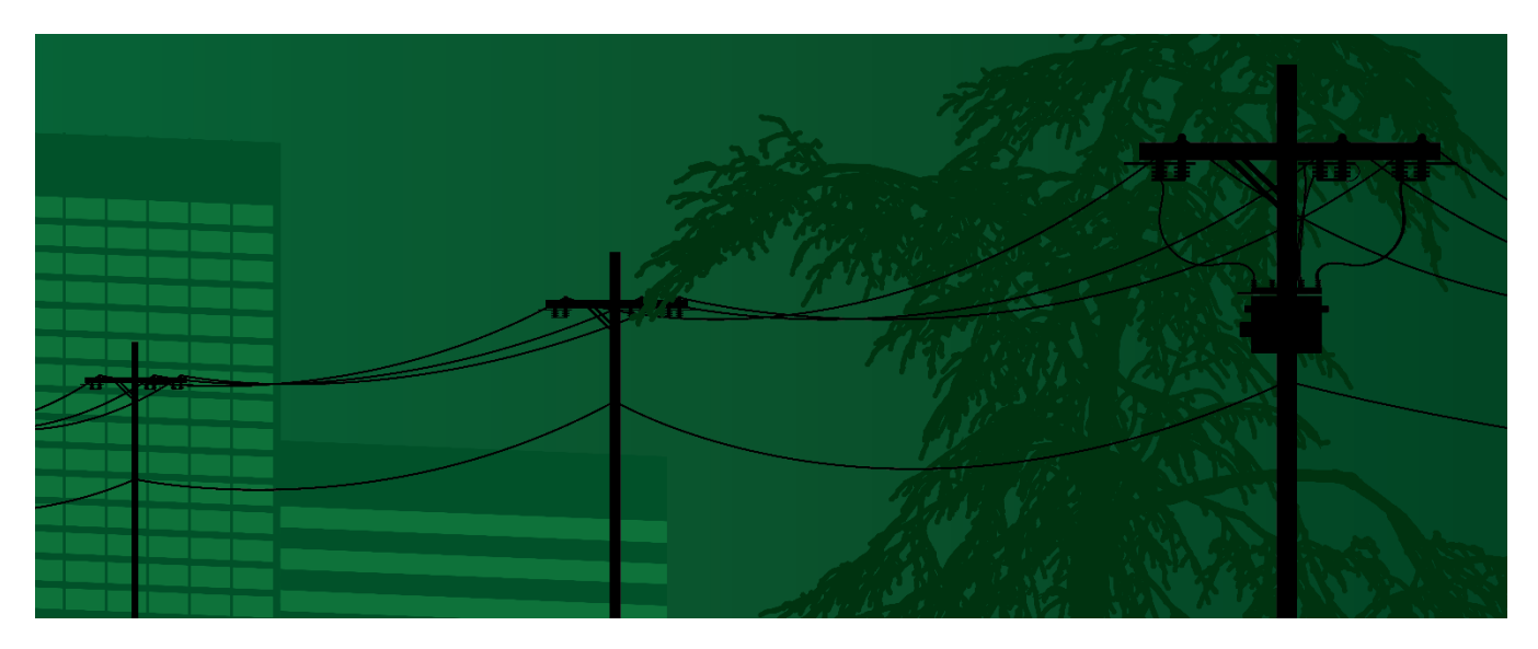
Three-Year Research Project Looks at Pole-Top Components, Vegetation Management, and More