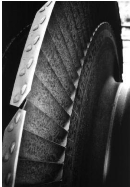
Corrosion on a turbine