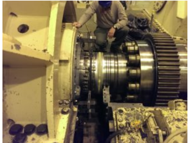
The EPRI-Suprock torsional monitoring system: The thin yellow strip on this turbine shaft is an epoxy-infused fabric that keeps electrical devices bonded in place when the shaft is spinning. Sensors and antennas are concealed under this strip.

2. One Device to Measure Strain and Acceleration: The conventional approach to wireless monitoring on a rotating shaft is to place sensors in locations specified to collect strain and acceleration data. Because the strain and acceleration sensors in the EPRI-Suprock system are so small, they can be installed just millimeters apart—in effect, the same location on a shaft. This results in significant savings in installation costs for the plant operator. “The technical advantages of the EPRI-Suprock system have lowered overall testing costs considerably compared to existing shaft-mounted sensor options,” said Chris Suprock, principal investigator of Suprock Technologies.