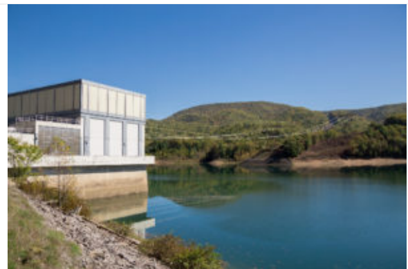
The Bath County Pumped Storage Station in Virginia's Allegheny Mountains has a capacity of more than 3,000 megawatts.