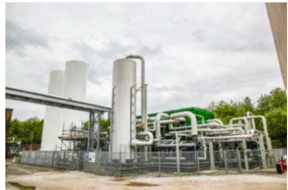
A 5-megawatt liquid air energy storage demonstration facility built by Highview Power Storage.

Longer term, more speculative technologies include thermal storage, advanced rail, and hydrogen.